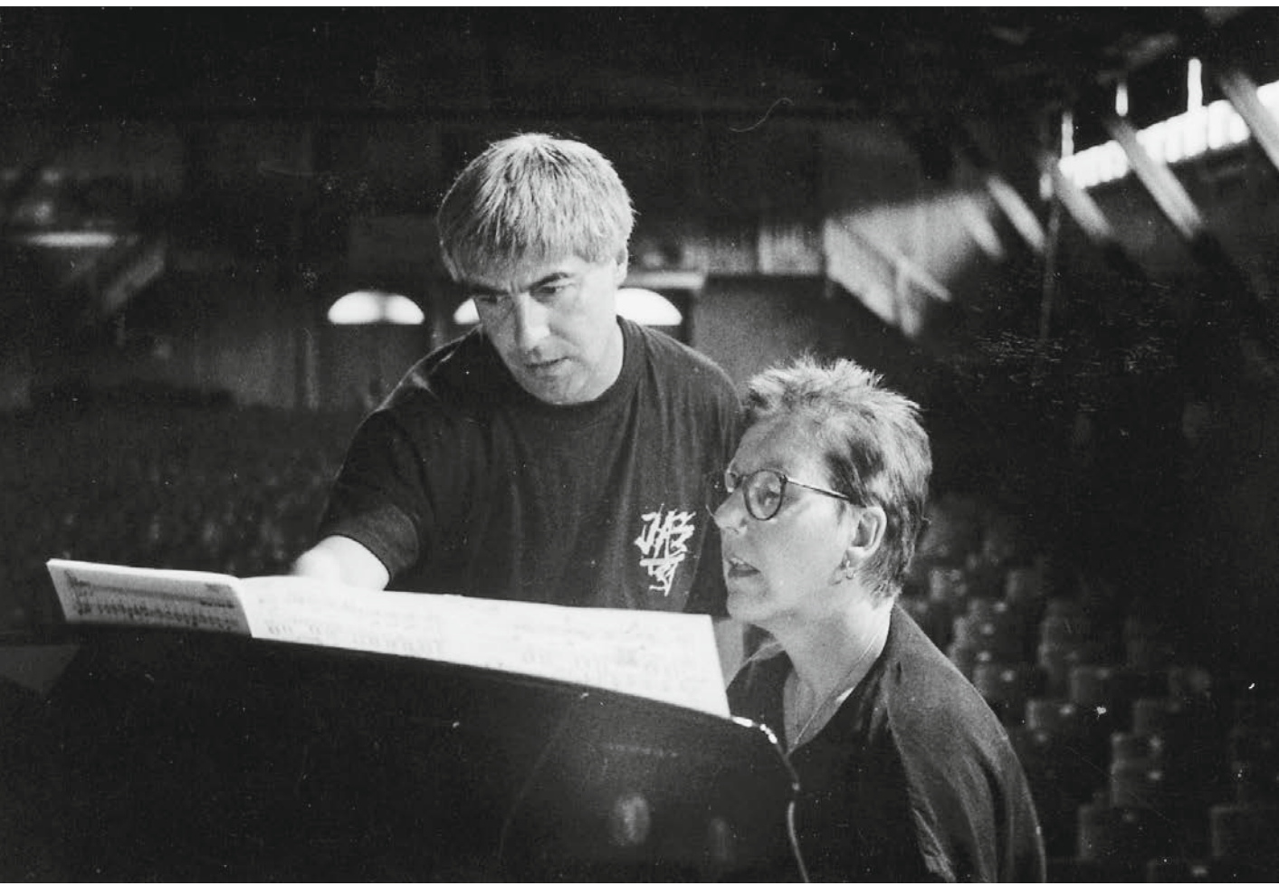
Barry Guy, Irène Schweizer, Jazzfestival Willisau, 1991.