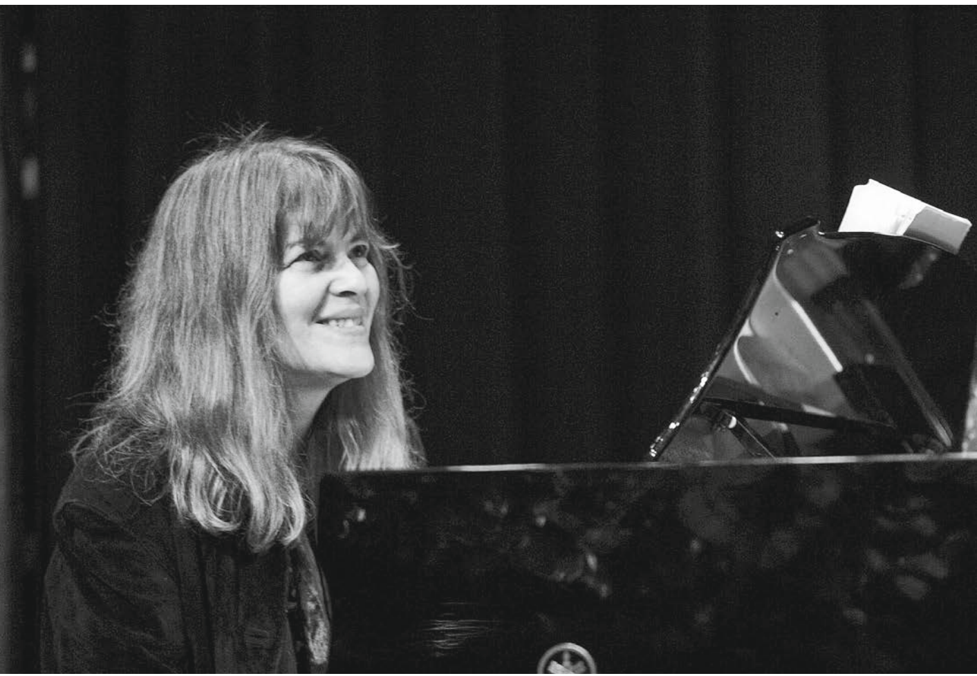
Marilyn Crispell. Rote Fabrik Zürich.