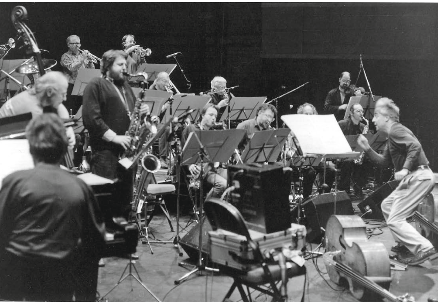
London Jazz Composers Orchestra. Rote Fabrik Zürich, 1993.