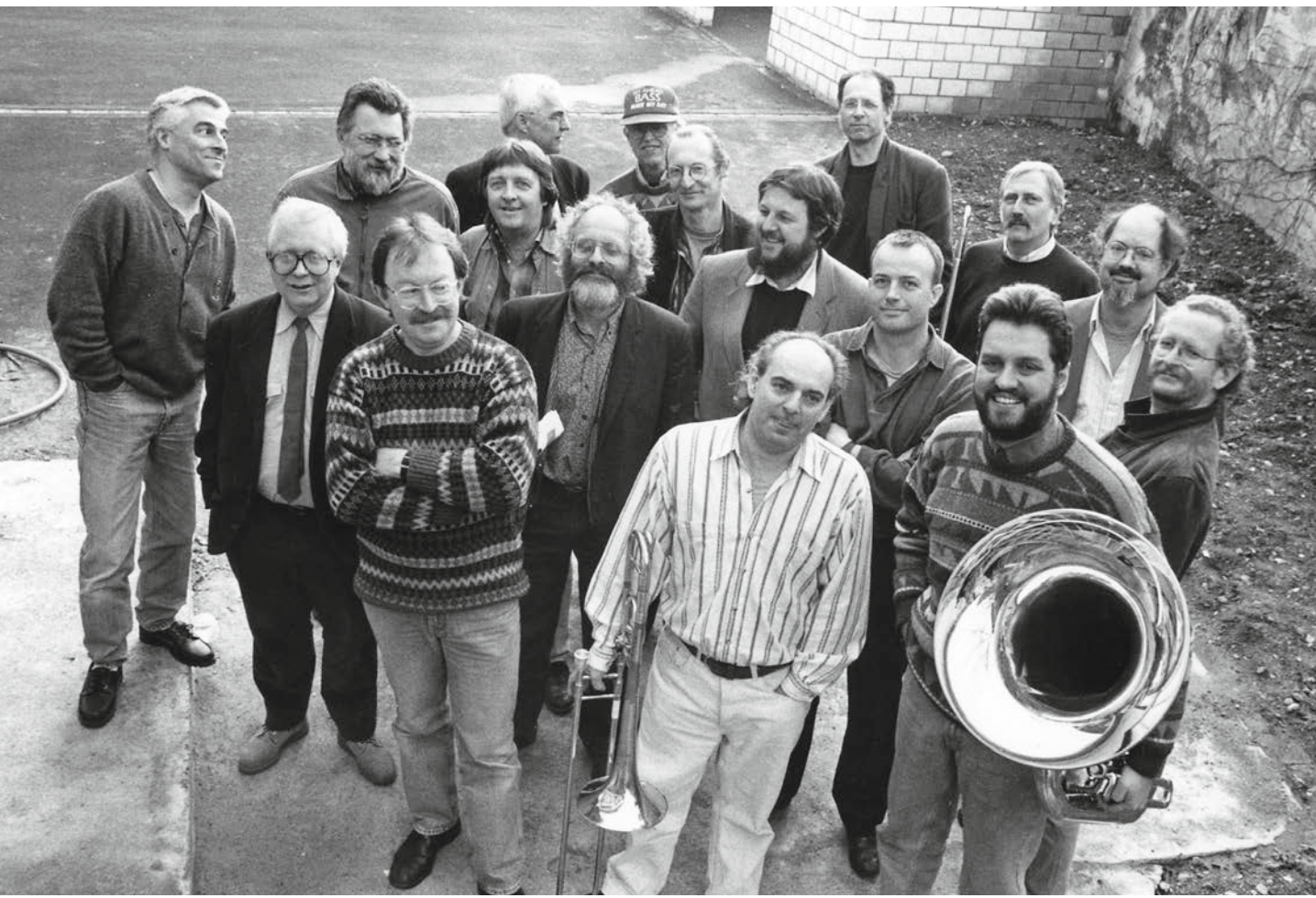
London Jazz Composers Orchestra. Rote Fabrik Zürich, 1989.