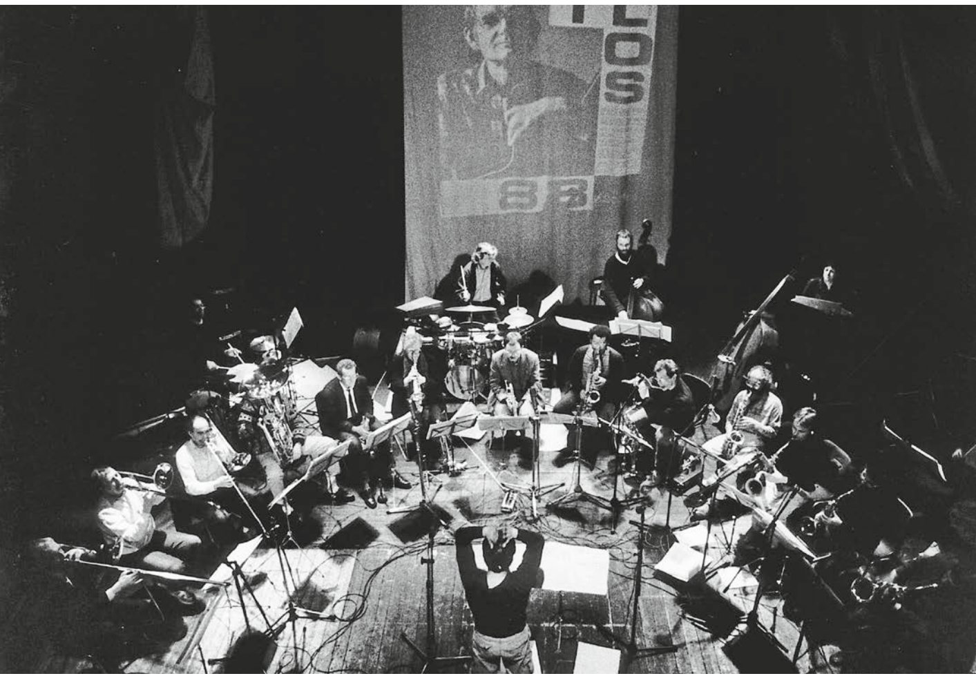
London Jazz Composers Orchestra. Taktlos, Rote Fabrik Zürich, 1988.