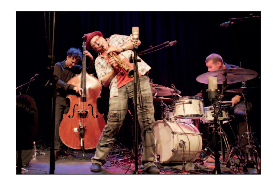
Depart, 2013